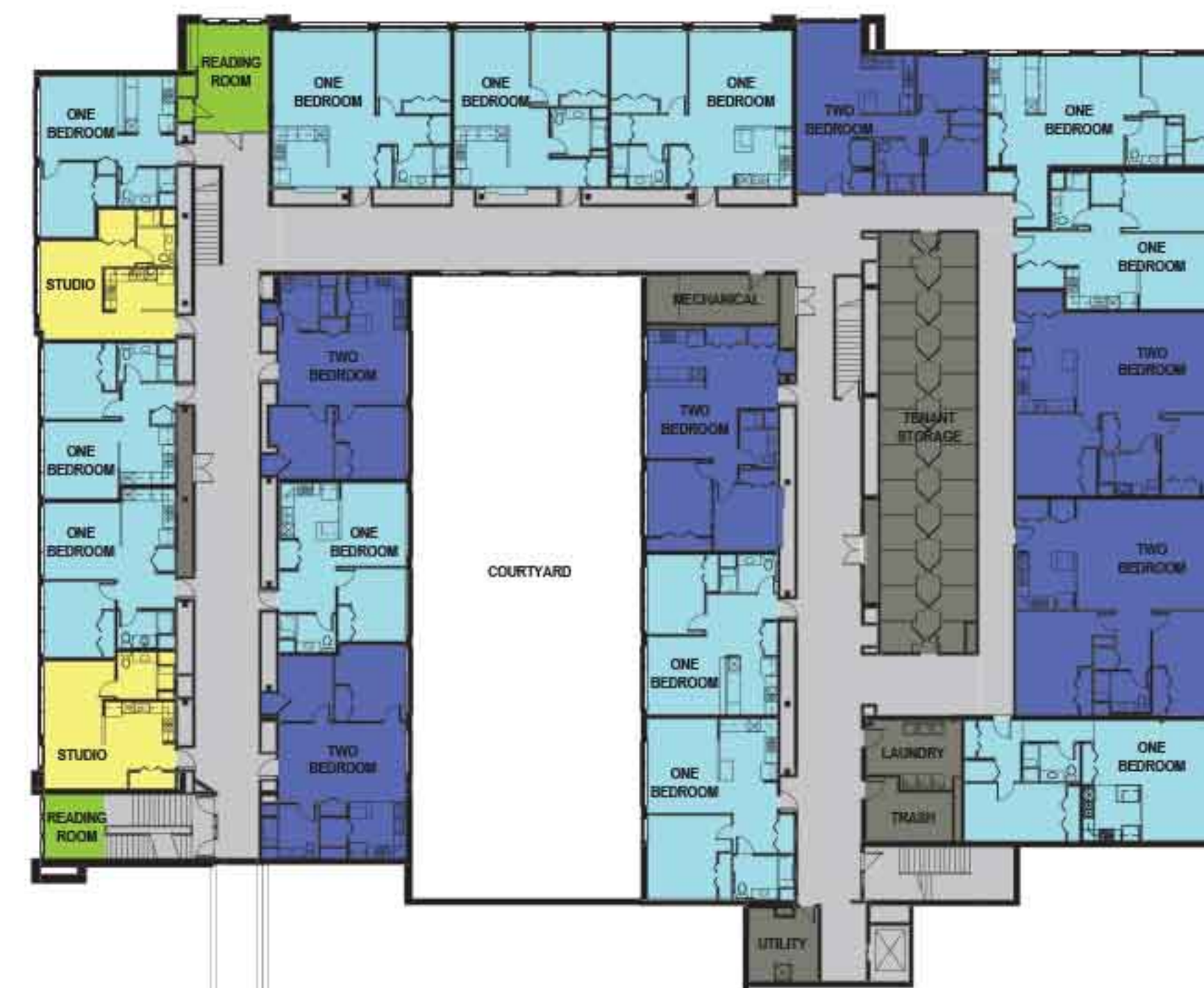
SECOND FLOOR PLAN DIAGRAM