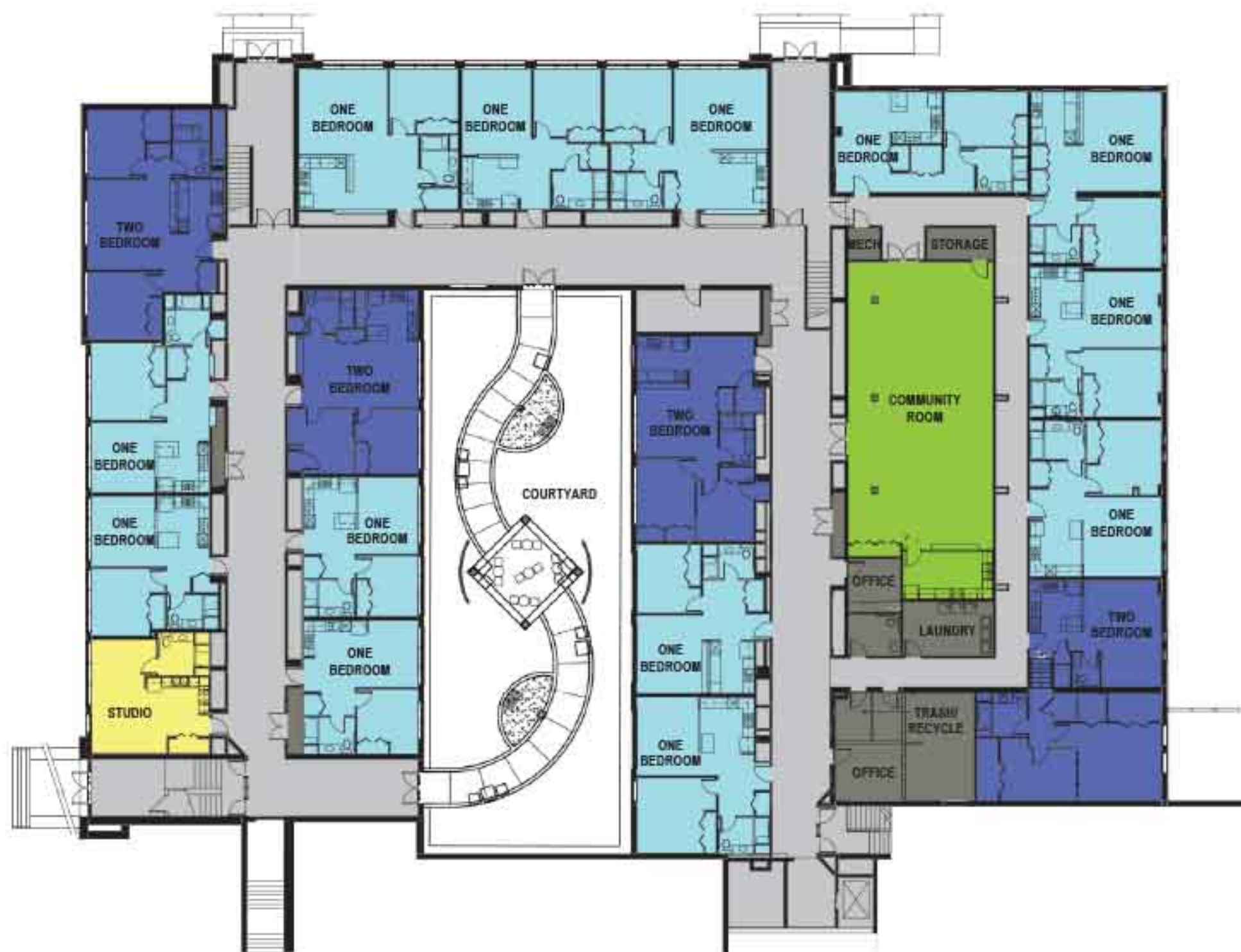
FIRST FLOOR PLAN DIAGRAM