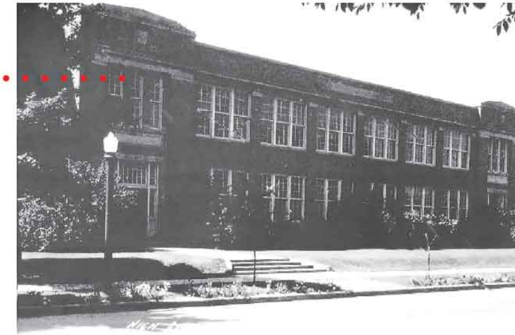
HISTORIC PHOTO SHOWING THE ORIGINAL WINDOWS (1926)